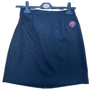
Girl's black contemporary skirt (hem of the skirt must rest at the top of the kneecap when standing)