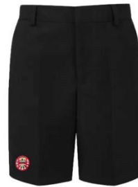
Black Shorts (summer term only)