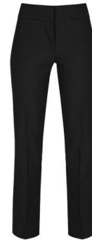
Girl's black contemporary trouser