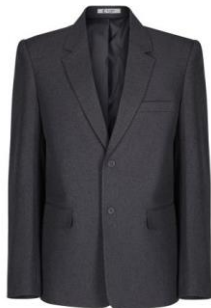
Unisex contemporary graphite grey blazer (with Highfields logo)