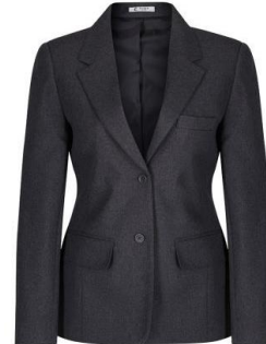
Girl's contemporary fitted graphite grey blazer (with Highfields logo)