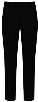
Boy's black contemporary trouser